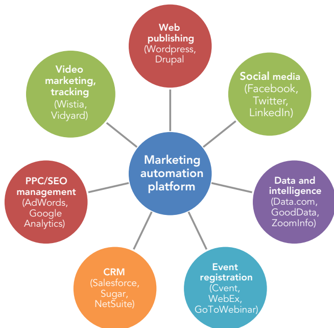
Table 3: The expanding B2B marketing automation ecosystem

The speed of marketing automation change has led even the largest vendors to open their platform architecture to facilitate integration with a wide range of independent software vendors (ISVs).